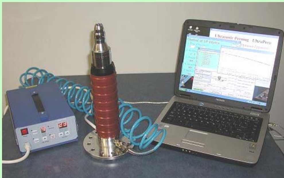
Basic UP system: ultrasonic transducer, generator and laptop (optional item)

One of the promising directions in using of the high power ultrasonic for industrial applications is the Ultrasonic Peening (UP) of materials, parts and welded elements. The UP produces a number of beneficial effects in metals and alloys. Foremost among these is increasing the resistance of materials to surface-related failures, such as fatigue, fretting fatigue and stress corrosion cracking. During the different stages of its development the UP process was also known as ultrasonic treatment (UT), ultrasonic impact technique/technology/treatment (UIT), ultrasonic impact peening (UIP).