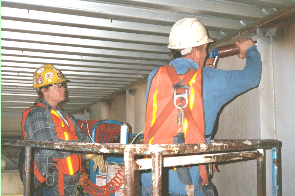
Ultrasonic Peening of welded elements of a highway bridge

The developed computerized complex for UP was successfully applied in different applications for increasing of the fatigue life of welded elements, elimination of distortions caused by welding and other technological processes, residual stress relieving, increasing of the hardness of the